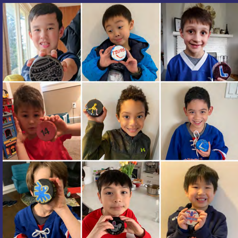
A big thanks to our puck artists! All these smiles are members of the TBirds U7 Division

All pucks will be visible from the outside of the building (ie look for windows!) Please do NOT enter any of the facilities during the hunt and respect physical distancing with anyone around.